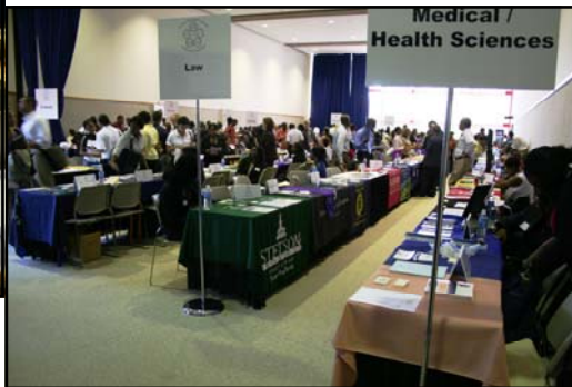
AS AN INFORMATION CENTER...AUC students interested in pursuing graduate study attended the AUC Consortium's annual Graduate/Professional School Information and Recruitment Fair in the RWWL Exhibition Hall. More than 200 colleges, universities and professional schools were represented.