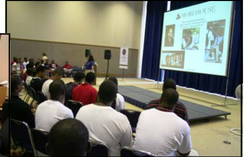
AS A RESOURCE...During Fall 2007 Orientation, new Morehouse College students learn about the many ways the Woodruff Library can assist in meeting their academic goals.