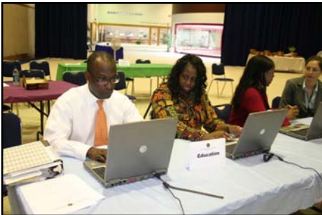
AS A LINK TO THE WORLD...During RWWL's 2007 New Faculty Orientation Luncheon, AUC faculty access some of the many electronic resources the Library offers. With RWWL remote access, faculty and students can use these virtual resources at any time or any place.