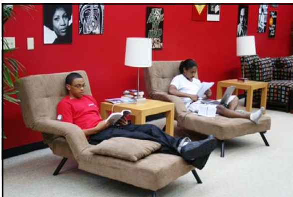
AS A QUIET SPACE...Responding to students requests for "quiet space" free of cell phones and other distractions, the Woodruff Library this fall debuted a new "Quiet Study Room" on the Lower Level in the former "Closed Reading Room." The area has quickly become students' "new favorite place" to read, study and just relax.