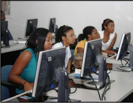
AS A LABORATORY...Spelman College ADW students get hands-on instruction in accessing the ARTstor database for research papers.

Imagine a classroom with nearly 220,000 square feet of space filled with electronic and print resources, computers, furniture, programs and services designed specifically with you in mind. Well, that's exactly what you have at the Woodruff Library of the AUC. Library staff are finding more and more ways to meet user needs for instruction, leisure space and electronic resources. Take a look at all the ways you use the Library!