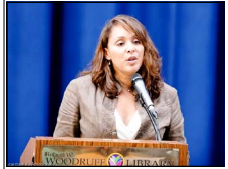
Natasha Trethewey, Phillis Wheatley Distinguished Chair of Poetry at Emory University and author of Native Guard, winner of the 2007 Pulitzer Prize for Poetry

ing selections from Native Guard that invoked images of her southern upbringing and shed light on indignities suffered by herself and other African Americans born of the Mississippi Delta.