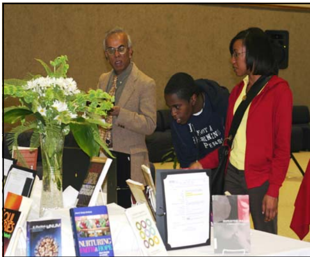
AUC students and faculty gathered to view the scholarship exhibited at the Second Annual RWWL Faculty Publications Exhibit & Reception.

The scholarly and artistic works of Atlanta University Center faculty were showcased on February 28 during the Robert W. Woodruff Library's (RWWL) Second Annual Faculty Publications Exhibit and Reception. Approximately 100 guests viewed selected books, book chapters, articles and artistic works on display. This year, the scholarship of Library staff also was included in the display.