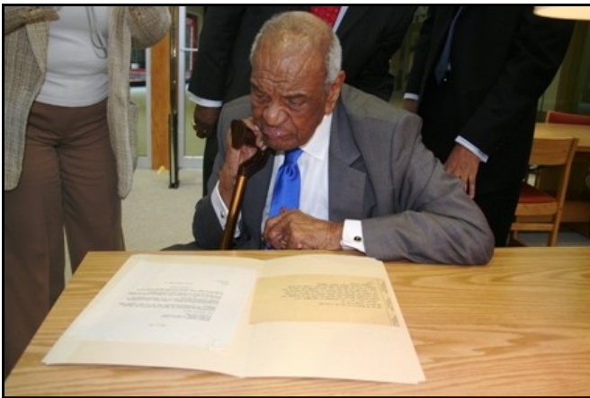
The Rev. Gardner C. Taylor reviews documents in the Archives Research Center. His collection of manuscript writings is now open for research at the Woodruff Library.

The Gardner C. Taylor Collection of manuscript writings is open for scholarly research at the Library's Archives Research Center.