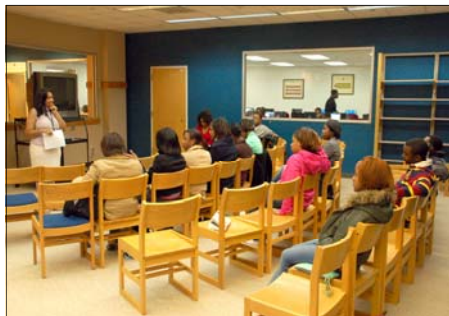
AUC students provide their thoughts on information literacy during a March focus group.

Talk about March Madness! The Robert W. Woodruff Library’s march toward establishing and maintaining a comprehensive information literacy program throughout the Atlanta University Center (AUC) is well underway. According to the American Library Association Presidential Committee on Information Literacy, the information literate know “...how knowledge is organized, how to find