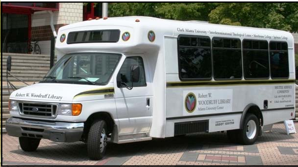
“The ABCs of Woodruff Transit,” introduced to riders in January include printed schedules, route maps and expanded operation of the Campus Express route.

Responding to rider needs, the Robert W. Woodruff Library (RWWL) of the Atlanta University Center in January introduced a new Shuttle Service concept for spring semester 2007—“The ABCs of Woodruff Transit” a new letter-oriented schedule and signage system that visually maps out shuttle routes, stops and arrival/departure times using letters of the alphabet.